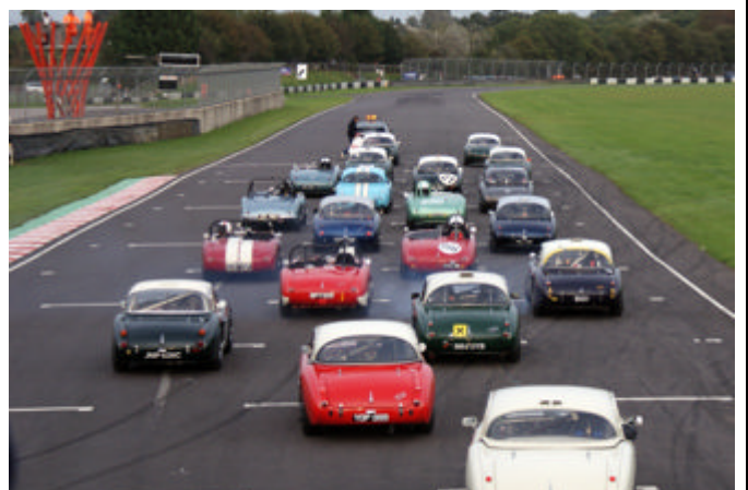
View of the Healey grid from the bus