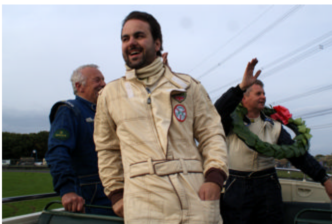
500 Race winners on open top bus