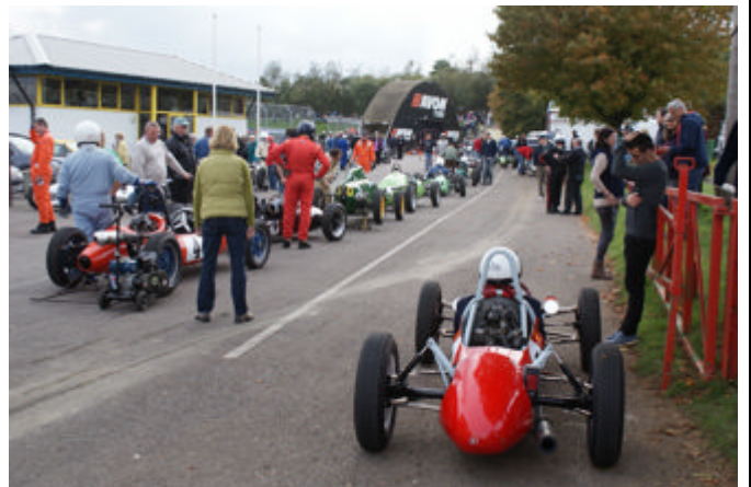
500's Line up for the Race