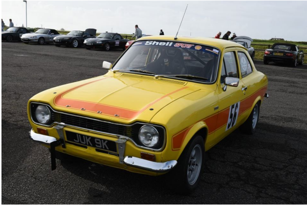
Ford Escort 1100L (?)