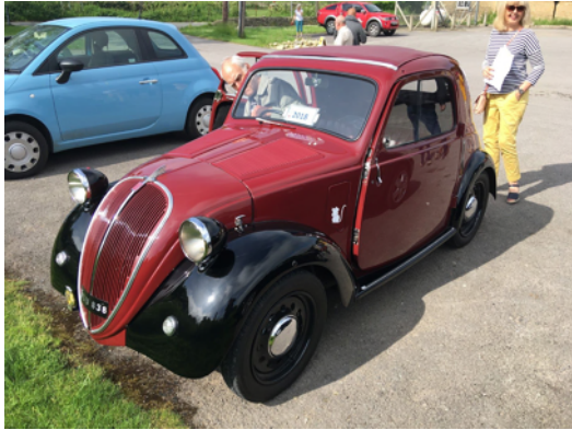
1939 FIAT Topolino