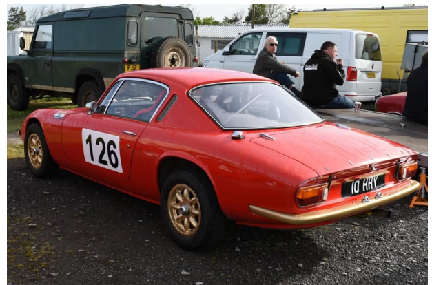
Lotus Elan +2