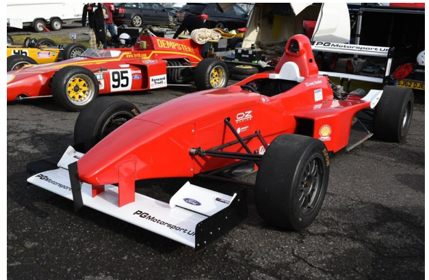
Van Diemen RF02