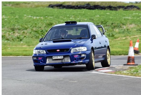
Steven Adams Subaru Impreza