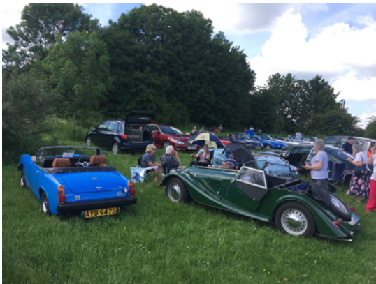
Dunfurlong Farm Shop & Cafe