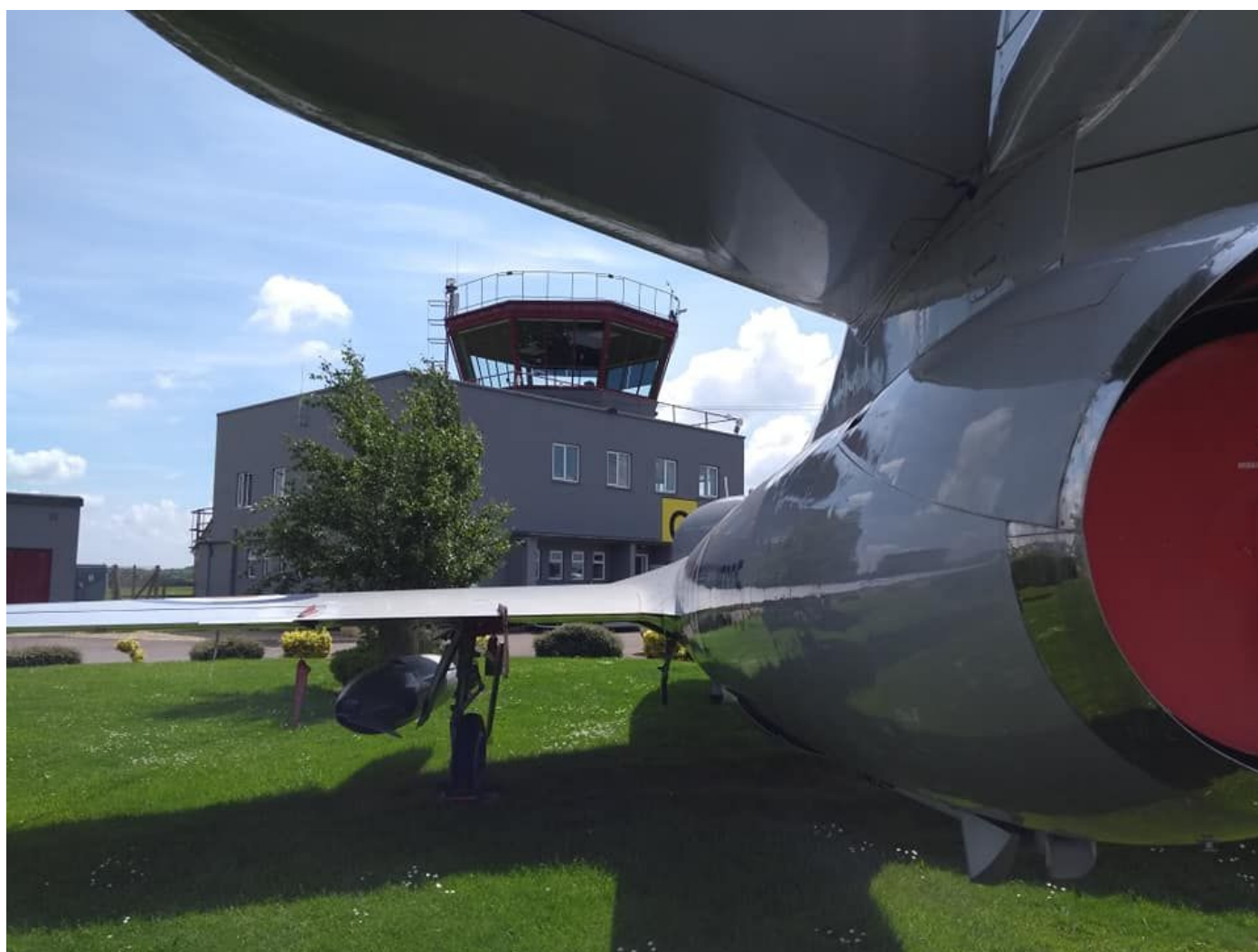
Hawker Hunter T8C, Kemble