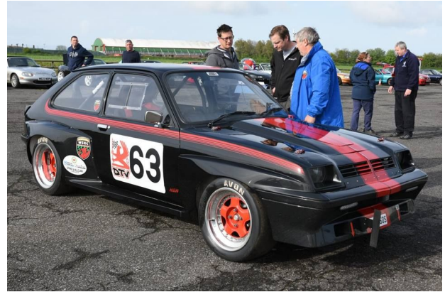
Vauxhall Chevette HSR