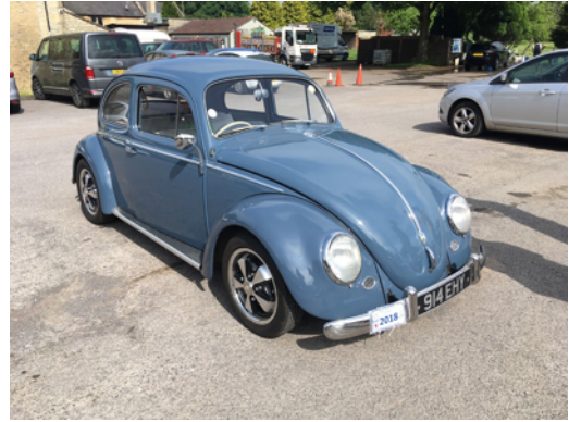
1959 VW Beetle