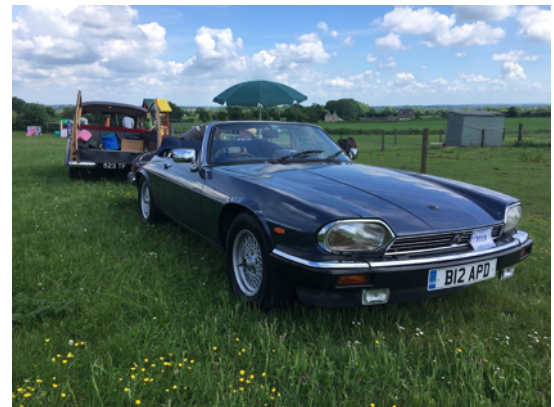
1989 Jaguar XJS