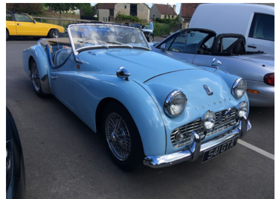
1960 Triumph TR2