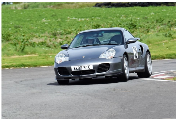
Matthew Bennett Porsche 911 Turbo