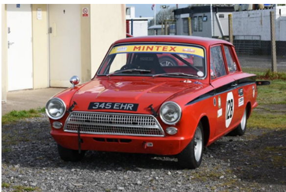
Ford Cortina GT