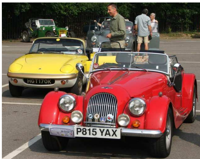
Photo : Start of the 2007 ACE Classic Tour

A fun Sunday run starting from BAWA in Southmead Road from 9.30am – what better excuse to get the car out.