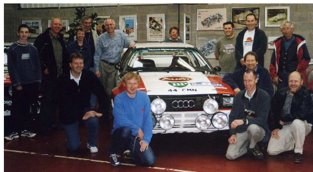
2004 – visit to David Sutton Historic motorsport museum