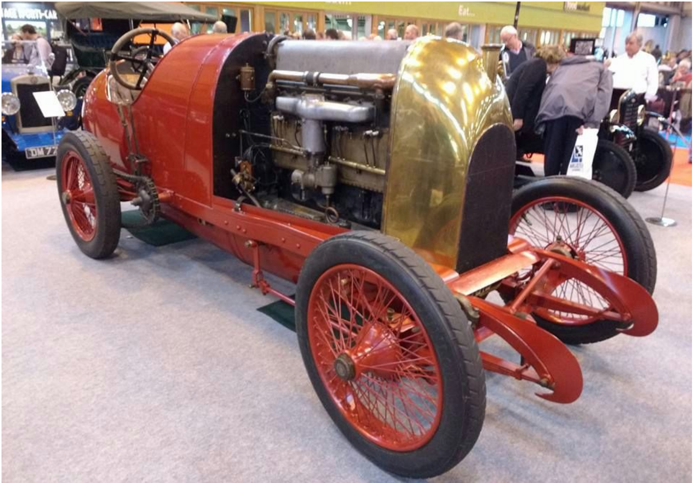
Duncan Pittaway's Fiat S76 at the Classic Motor Show