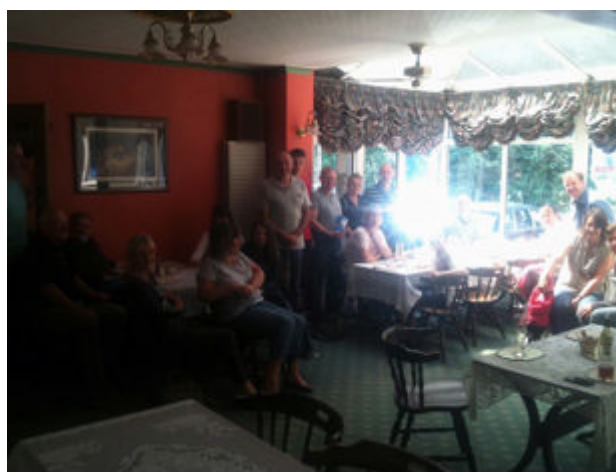
Lunch At The Burrington Inn